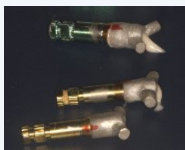
Fig. 4. Specimens after luting