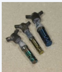
Fig. 5. Separated frameworks