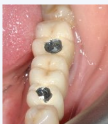
Fig. 1. The occlusal view of cement-retained implant restoration after location of abutment holes.

The aims of the study were: 1) to determine the influence of type of cement on framework separation from the abutment; 2) to establish mechanical factors that have an impact on the strength of restoration adherence to the prosthetic abutments; 3) to estimate the average disintegration temperature for each cement.