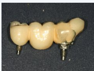
Fig. 2. The restoration is retrieved together with the prosthetic abutment from the implant