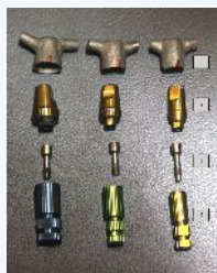
Fig. 3. Before cementing

All specimens were divided into 4 groups: 1) polished abutments and passive frameworks; 2) polished abutments and non-passive frameworks. Every specimen was placed in a dental furnace (Vacumat 40T; Vita Zahnfabrik, Bad Sickingen, Germany) for 5 minutes in 300 C° temperatures. The abutment and metal framework were tried to be separated. If not successful, the specimen was put to oven for 5 min increasing temperature for 50 C° till 700 C°.